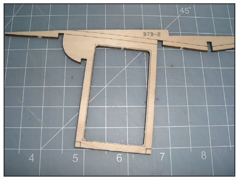
☐ 2. Use a pencil and ruler to draw a line that is 1/64" outside the inlet duct opening in B7B-2. Repeat for the other side (Photo 2)